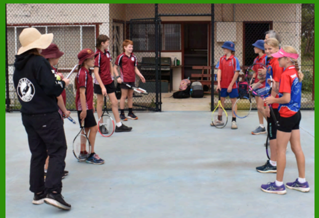
Ungarie Central School & Wyalong Public school tennis teams in action at the Ungarie tennis courts.