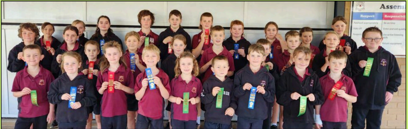
Above: Primary place getters. Below: Secondary place getters.