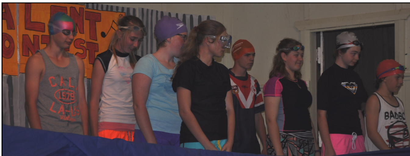
The Year 9/10 Synchronised Swimming team