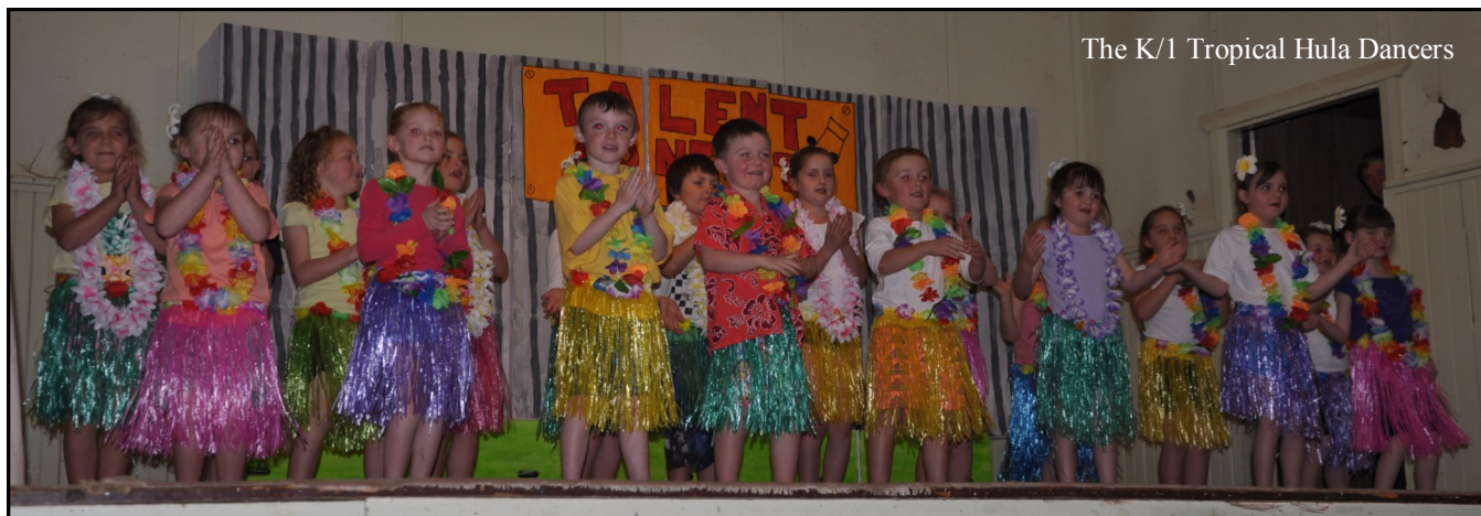
The K/1 Tropical Hula Dancers