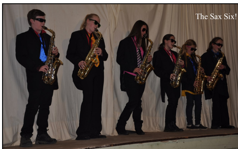
The Sax Six!