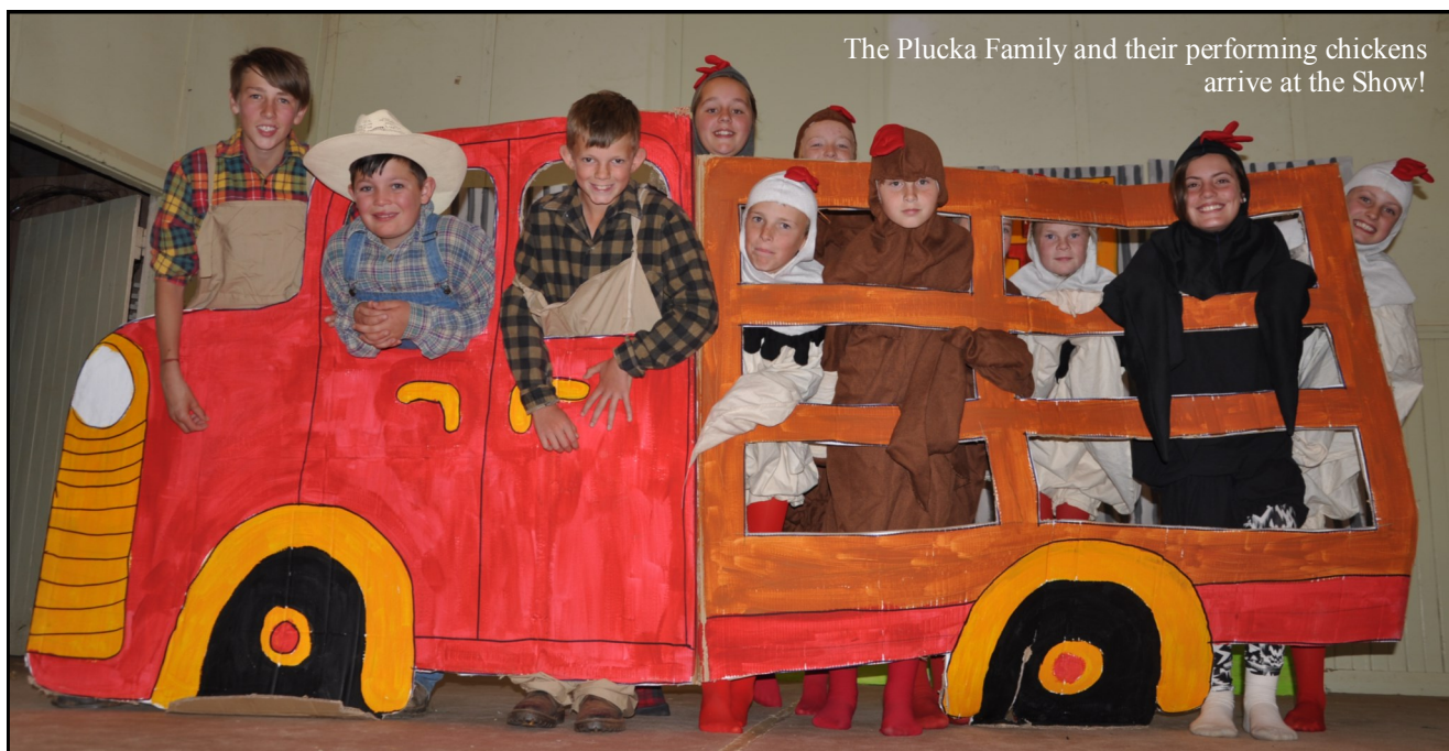
The Plucka Family and their performing chickens arrive at the Show!