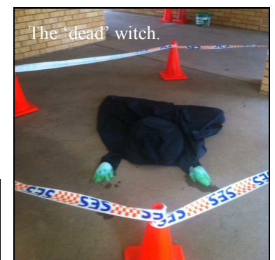
The 'dead' witch.