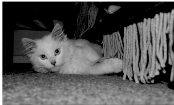
Emily Bussenschutt—Rule of Thirds