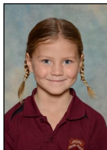
Maicey Ross Kindergarten