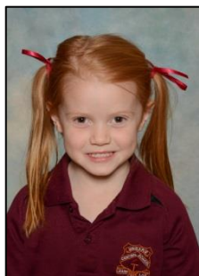
Ella Burley Kindergarten