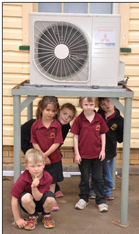
We went under the air conditioner. By Mia Carroll