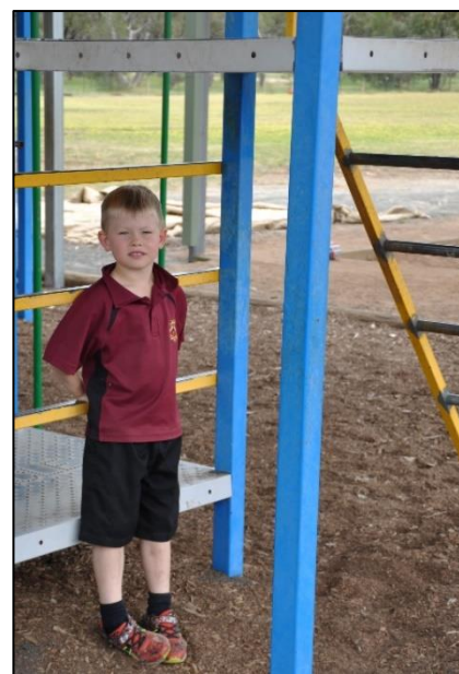
I am under the climbing ladder.