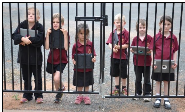
We are behind the fence. By Shaylee Crofts