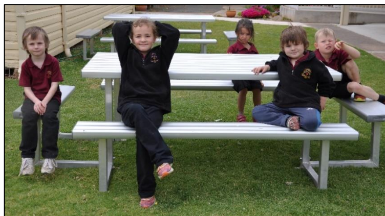
We are on the lunch table.

Kindergarten have been investigating 'Position'. We had fun walking around the school with the iPads and taking photos.