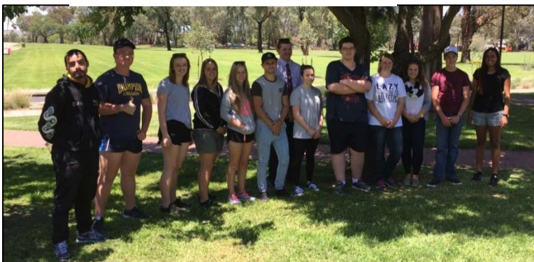
Students from Ungarie Central School, Condobolin High School, Tullibigeal Central School and Lake Cargelligo Central School.