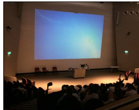
Lecture theatre at the University of Wollongong.