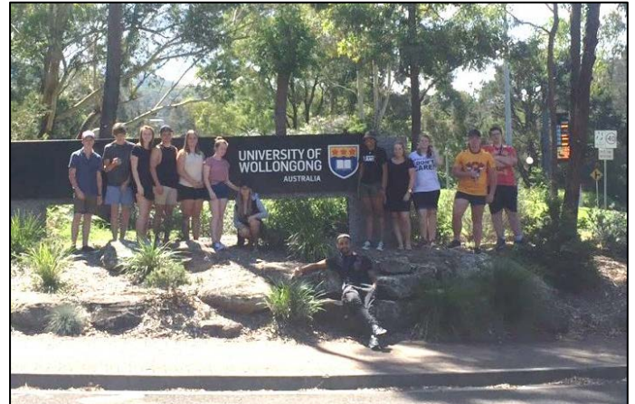
Students at the University of Wollongong.