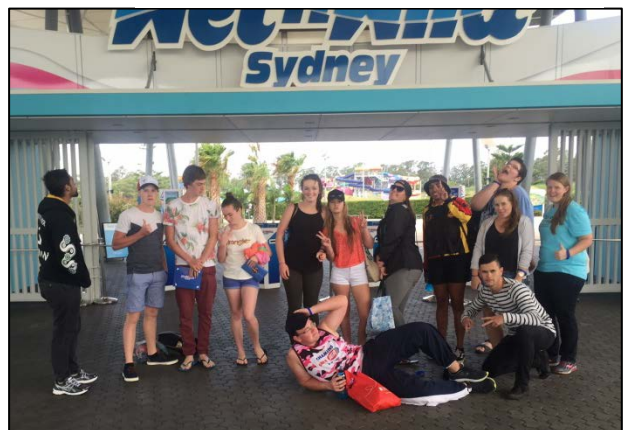
Students about to visit 'WetnWild'.