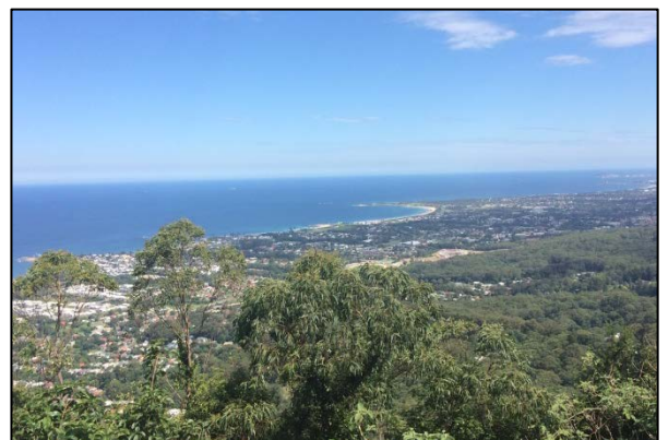
Wollongong from the lookout.