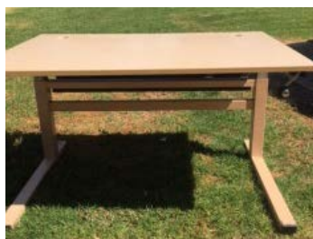
8 x Adjustable height computer desks (Top 1170mm x 785mm)

plus 2 Wall mounted display cabinets with shelves and glass sliding doors. (290mm deep x 920mm high x 1800mm long)