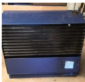
2 x LPG Gas Heaters (Were working when removed)