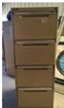
8 x (4 drawer) Filing Cabinets Some with keys

Community members are invited to purchase the items listed below from the school. Please ring or email the school and make an offer.