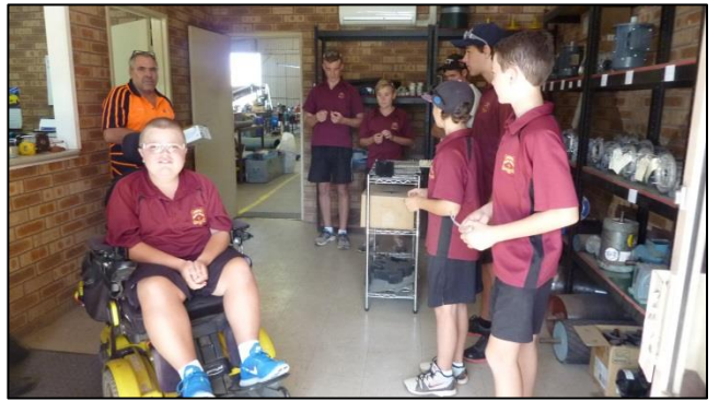
Above and left: Students in the workshop.

On Tuesday 5 th April Yr 9/10 Design and Tech went to Griffith to watch some of our farm signs being cut out by the water jet cutter at Midwest Conveyor & Belting Services. Brad showed us how to use the program on the computer to finalise our designs so that they were right to cut. This program can be used to design anything from signs to truck parts. They allowed us to be hands on by controlling the path of the water jet.