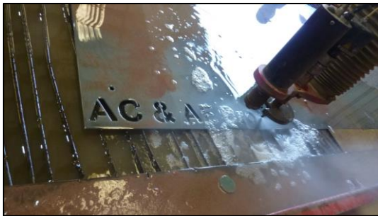
Above and left: Water jet cutter at work