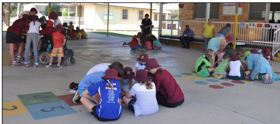
Above: A race to the finish - all teams racing to complete the world map jigsaw. Left: The 'French' team with their finished world map.