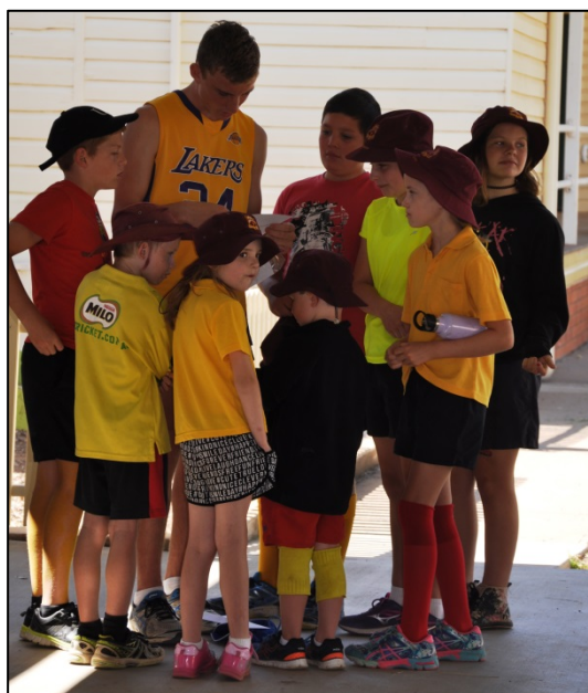
The 'German' team deciphering a clue to move to the next country.