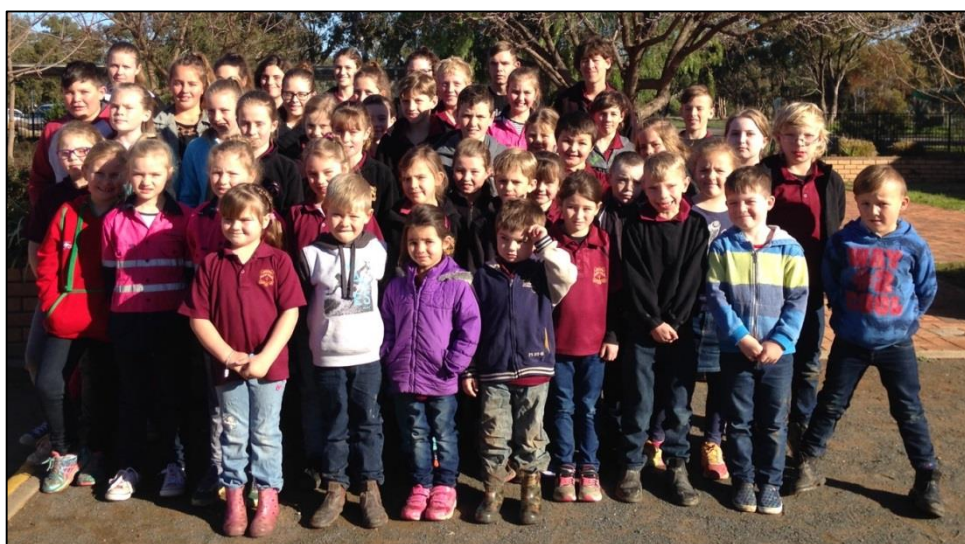
Students supporting 'Jeans for Genes'.

Our athletics carnival was eventually held on Wednesday 10 th Aug after numerous changes of date due to rain and a wet oval. There was some fantastic competition on the day. Results and more photos will appear in next week's newsletter.