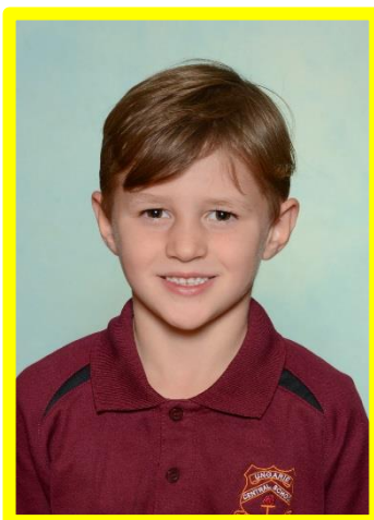
Lincon Bryant Kindergarten