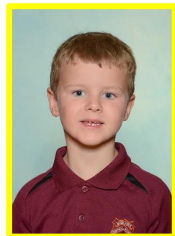
Sam McClintock Kindergarten