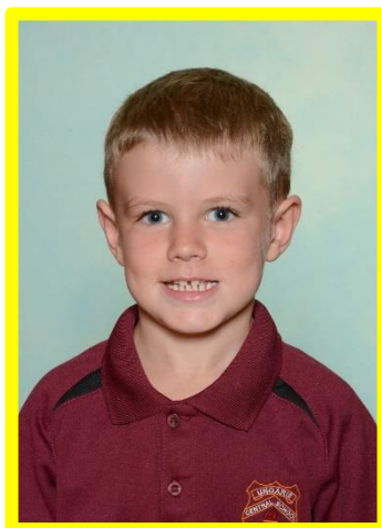
Owen Jackson Kindergarten