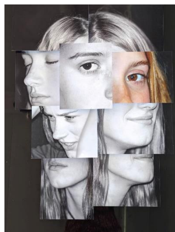
Stage 5 artwork for Dramatic Minds representing 'Hope'.