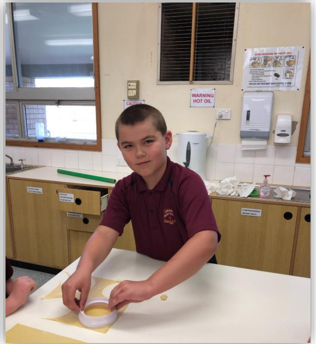
Linden cutting pastry