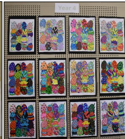
Year 4 colouring in.