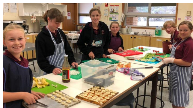
Right: Yr 5/6 Food prep