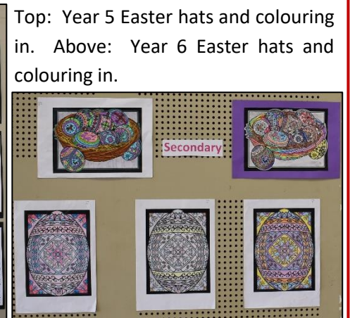
Secondary colouring in.

Top: Year 5 Easter hats and colouring in. Above: Year 6 Easter hats and colouring in.