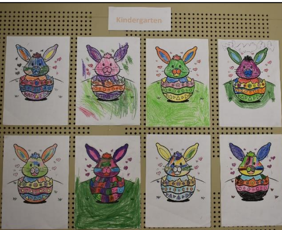
Kindergarten colouring in.