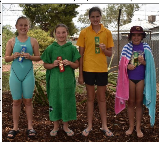
Senior Primary 1 st , 2 nd and 3 rd places.