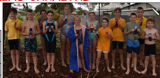
Junior Primary 1 st , 2 nd and 3 rd places.