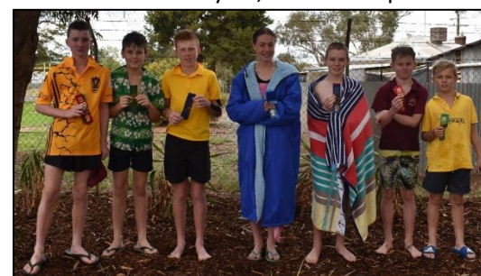
Junior Secondary 1 st , 2 nd and 3 rd places.