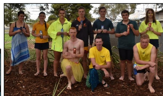
Senior Secondary 1 st , 2 nd and 3 rd places.