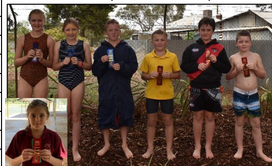
11 Years Primary 1 st , 2 nd and 3 rd places.