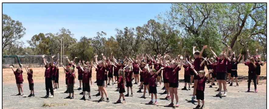
#bustthedust on Friday 13 th December, at 1pm was organised by St John's Parish School Trangie. Schools across Australia danced to raise awareness of the impact the drought is having on people and their communities.