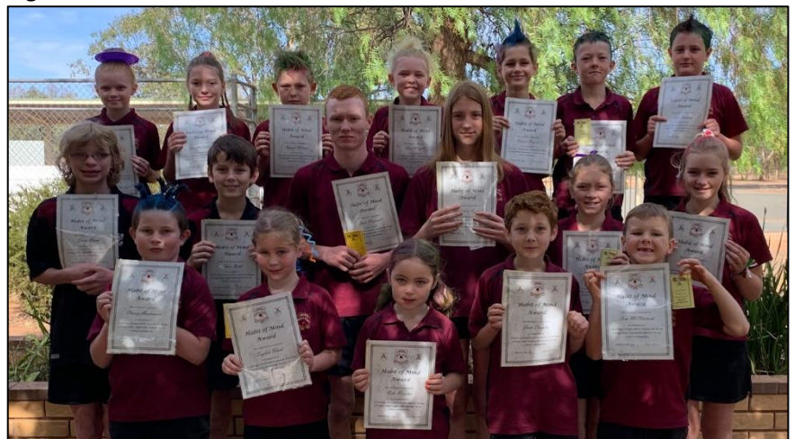
Above: 20 Habit of Mind Awards.