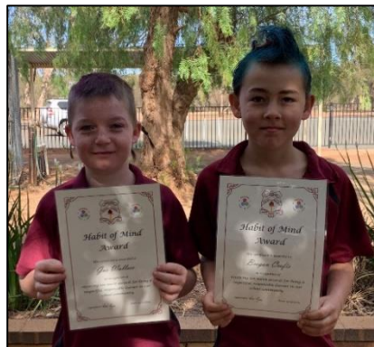
Above: 10 Habit of Mind awards. Right: 30 Habit of Mind Awards.