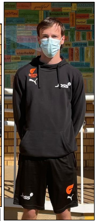
Top: Year 7/8