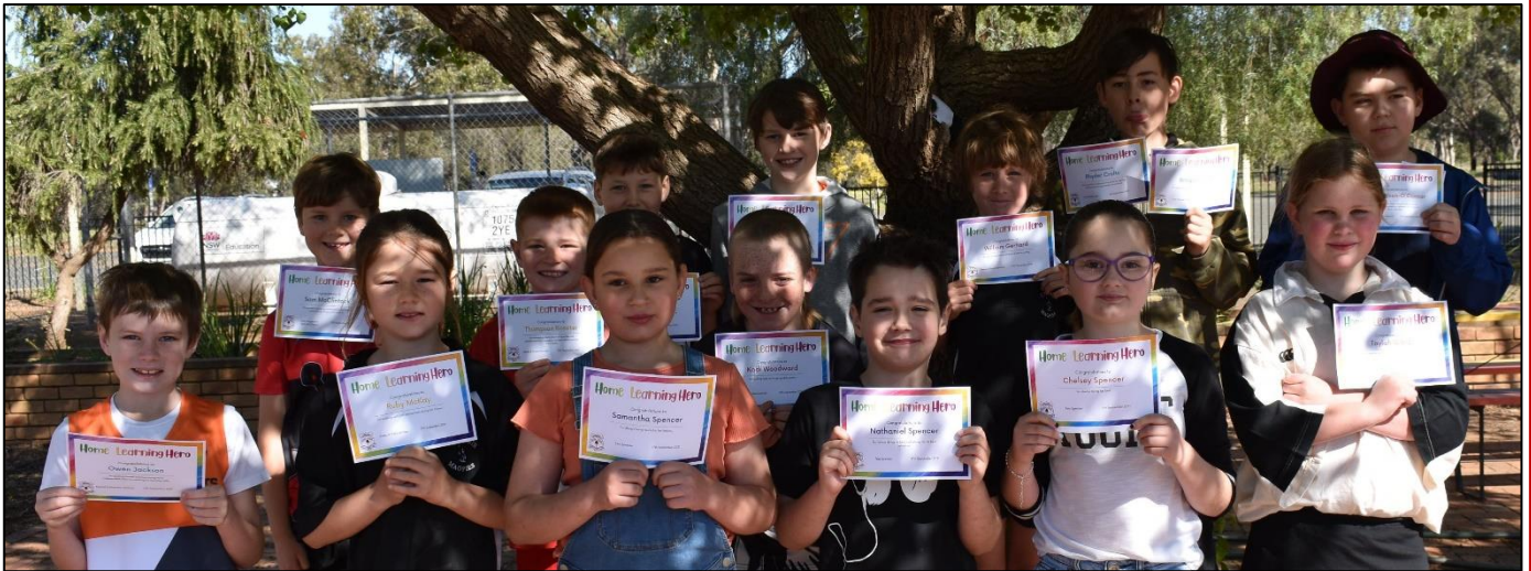
Year 3 / Year 4 Parent Recognition Awards