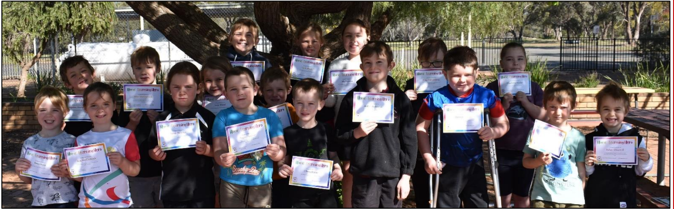
Kindergarten / Year 1 / Year 2 Parent Recognition Awards