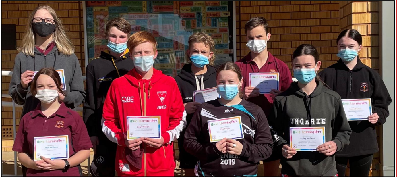
Above: Year 9 / Year 10 Parent Recognition Awards Below: Year 11 / Year 12 Parent Recognition Awards