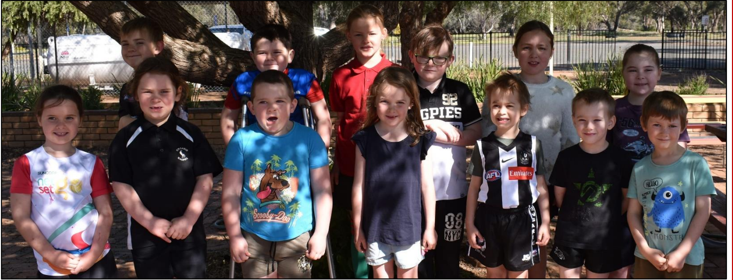
Kinder / Year 1/2

On Friday 17 th September $135 was raised for the Fight Cancer Foundation by wearing footy colours.