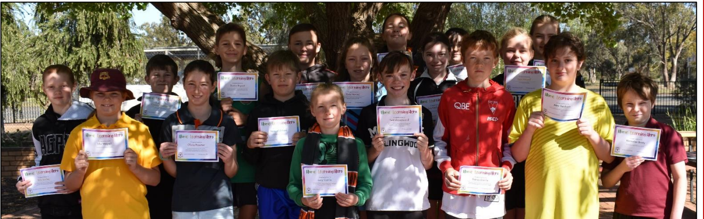
Year 5 / Year 6 Parent Recognition Awards