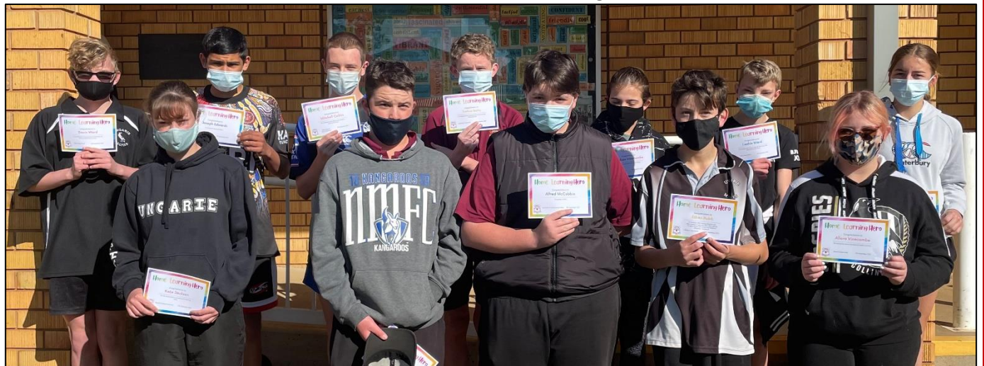
Year 7 / Year 8 Parent Recognition Awards